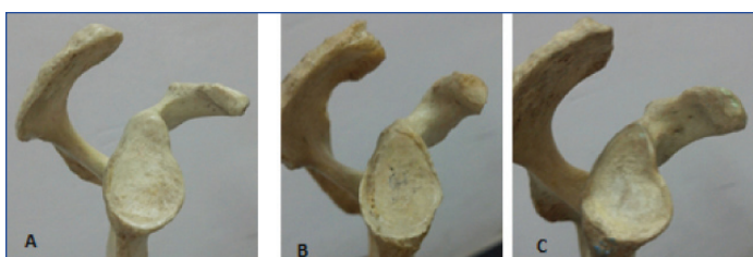
[Table/Fig-2]: Different shapes of glenoid cavity A-Pear, B=Oval and c= Inverted Comma.

In present study, total 100 scapular glenoid cavities were studied, out of which 56 were of right side and 44 were of left side. On the basis of presence or absence of the glenoid notch, three shapes were observed. Most common shape of glenoid cavity in present study was pear shape that is 44% (42.9% on right side and 45.5% on left side) followed by oval shape in 34% (35.7% on right side and 31.8% on left side) and Inverted comma shape in 22% (21.4% on right and 22.7% on left side) [Table/Fig-2,3]. Mean values of measured parameters were, SI diameter 34.24±3.27 mm, AP-1 diameter 23.93±2.67 mm, AP-2 diameter 12.96±1.84 mm and glenoid cavity index 70.12±7.13 in total scapulae [Table/Fig-4].